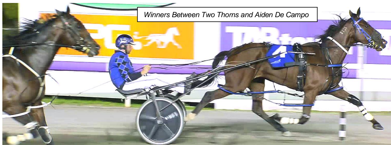
Winners Between Two Thorns and Aiden De Campo

American bred mare Kiwi Rose, the dam of Between Two Thorns, is a daughter of champion NZ mare Tupelo Rose (In The Pocket USA) 1:51.2 $879,867 who raced successfully in the US before returning to New Zealand in foal. This family is producing in the US as well as Australia with top flight horses Mad Max Hanover (Always B Miki USA) 1:47.4 US$657,163, Machapelo (Mach Three CA) 1:51.3 US$690,290, Resistance Futile (Real Desire USA) 1:49.1 US$402,109 and Rockapelo (Rock N Roll Heaven USA) 1:49.1 US$859,586.