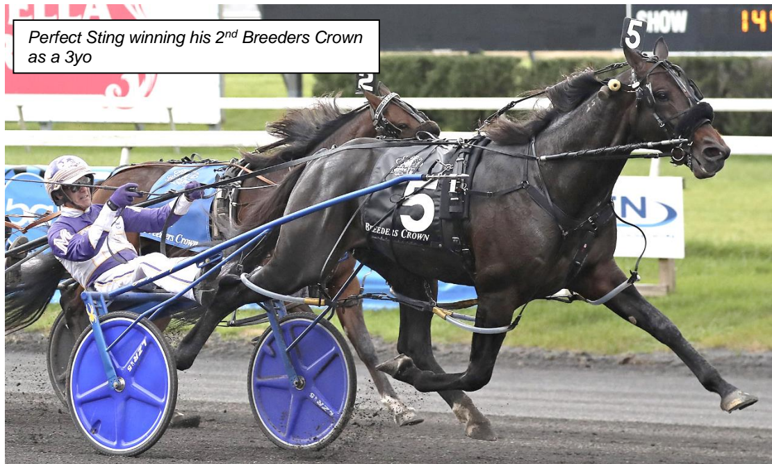
Perfect Sting winning his 2 nd Breeders Crown as a 3yo

World champion Shebestingin won 18 races all up from age 2 to 4. Most of the race names aren't recognisable in the southern hemisphere but needless to say, winning $759,000 10 years ago should say enough. She has 3 foals of racing age for 3 winners, and was wisely returned to Always B Miki for her 2022 and 2023 foals.