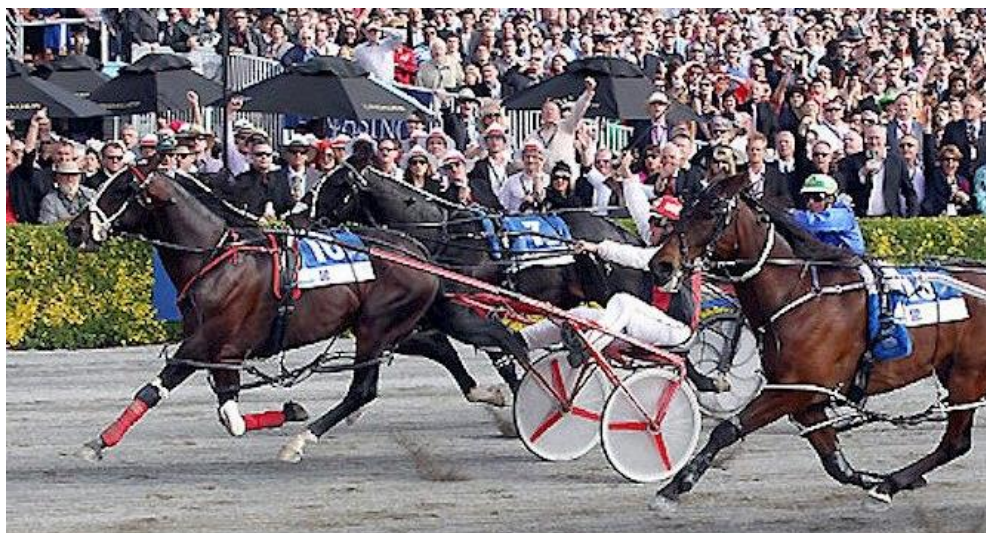
Terror To Love winning one of his three New Zealand Trotting Cups in front of a full house

☑ Champion Copy That NZ (American Ideal USA) , 4 th in the 2022 Auckland Cup is very likely to stay home and not head north for the Constellations Carnival, to concentrate on trying to win the New Zealand Cup for the third time, joining just 3 other pacers ( Terror To Love 2011-2013, False Step 1958-1960, Indianapolis 1934-1936) who have achieved that feat. Recent dual winners include Lazarus, Monkey King, Flashing Red and Just An Excuse. The Cup will be run at Addington on November 14.