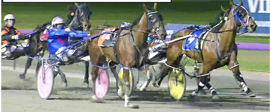
August Moon (4) holds out Turn The Page (12)