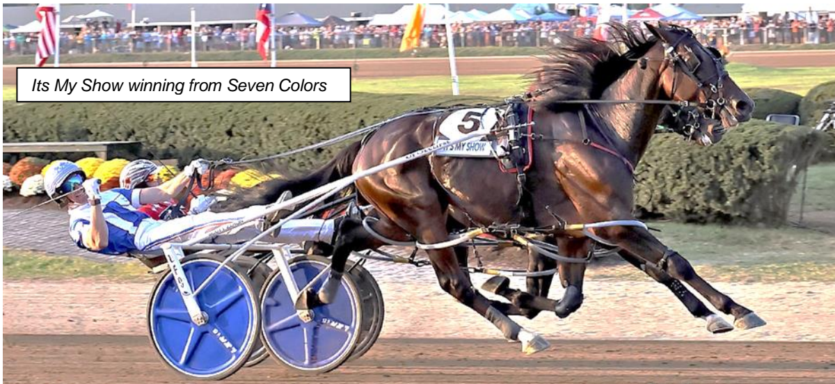
Its My Show winning from Seven Colors

☑ A real test of strength, the $1 million Little Brown Jug on the brilliant half mile track at Delaware lost none of its gloss for being without Confederate. Heat winners raced for $50,000 with the 5 horse final worth $850,000. Heat winners were Ken Hanover (Captaintreacherous) who paced the fastest mile in Jug history running 1:48.4, Moment Is Here (All Bets Off) and Cannibal (Sweet Lou) . The Final was won by Its My Show (Sweet