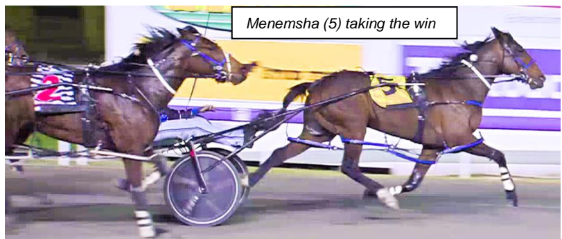
Menemsha (5) taking the win

Menemsha was well beaten in the $100,000 2YO Sales Classic in March, but re-emerged in July as a better stronger colt. He breezed twice for places in August before winning the $100,000 Pearl at the end of that month. His Pearl win was equally impressive, especially for a colt who started at 19/1 from outside the back line. A fortnight later Menemsha starting in 5 in the $215,000 Westbred 2YO Colts and Geldings Classic, at a more respectable 6/1. Breezing all the way he went on to an impressive win by 2.4m in 1:56.7.