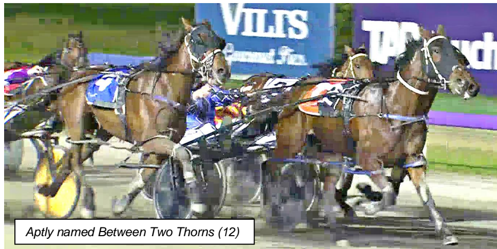
Aptly named Between Two Thorns (12)

in November. First up started on the 3rd line of betting from outside the backline, just missed some interference to settle one out 2 back, quick lead and first qtr over the sprint 1730m journey, first to move 3 wide at the 600m, almost in the lead at the 400m, very competitive finish down the straight and just did better to win the $21,000 3YO Fillies Pace by a half head in a slick 1:56.8, last half 59.7;