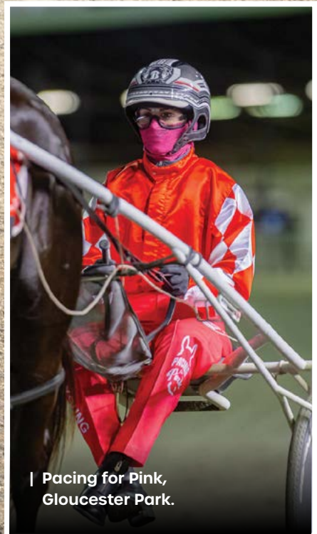
| Pacing for Pink, Gloucester Park.