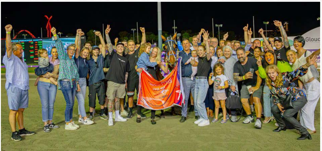
| Deb Whitehead celebrates the win of August Moon with fellow connections in the G1 WA Oaks.