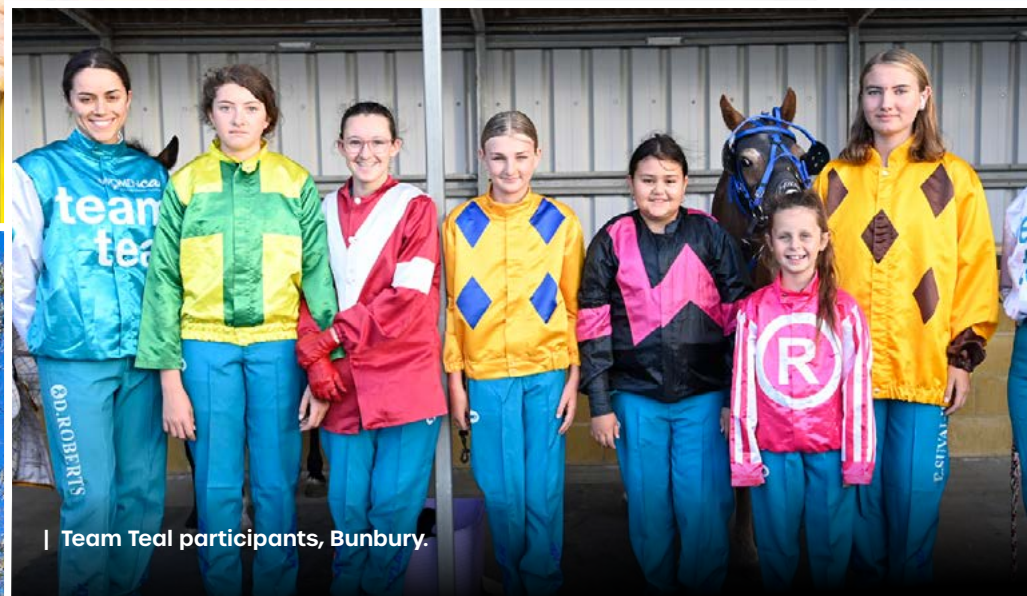
| Team Teal participants, Bunbury.