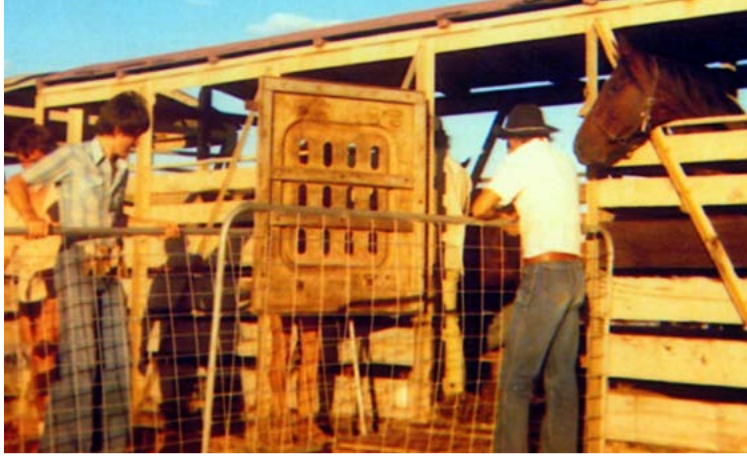
| Trunkey horses loaded onto trains at Tarcoola station.