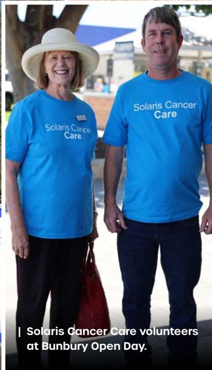
| Solaris Cancer Care volunteers at Bunbury Open Day.