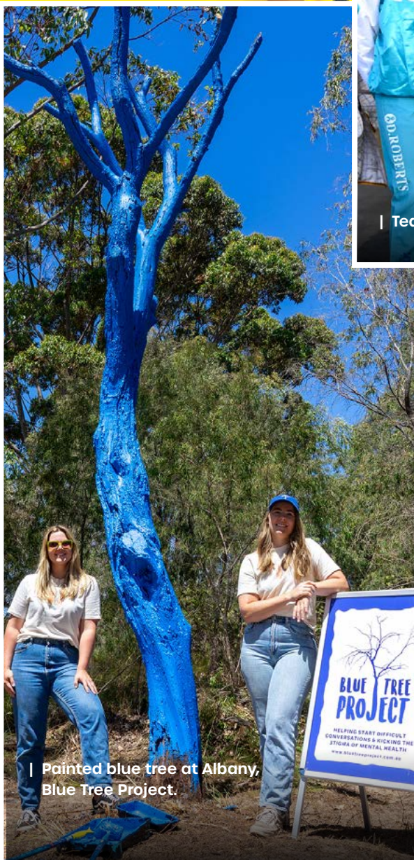
| Painted blue tree at Albany, Blue Tree Project.