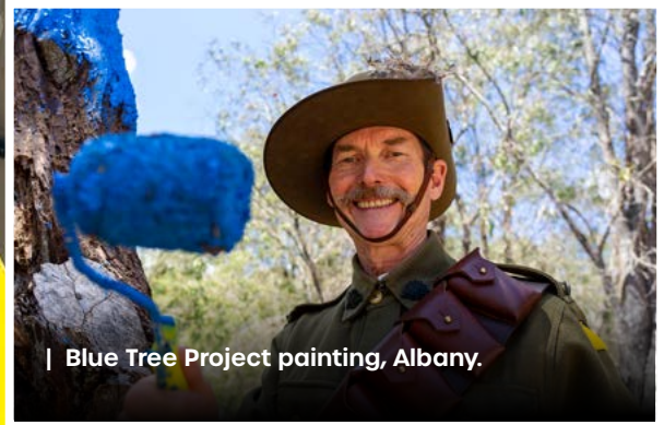
| Blue Tree Project painting, Albany.