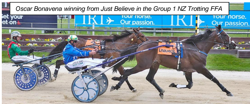
Oscar Bonavena winning from Just Believe in the Group 1 NZ Trotting FFA

luck Queen Elida (Love You FRA) with $945,000 in earnings, should join the list soon. Of course with the money available in Slot races even for a place it does skew the results for the new brigade of trotters. Worth noting is that the progeny of One Over Kenny have won over one million, which is also an incredible effort.