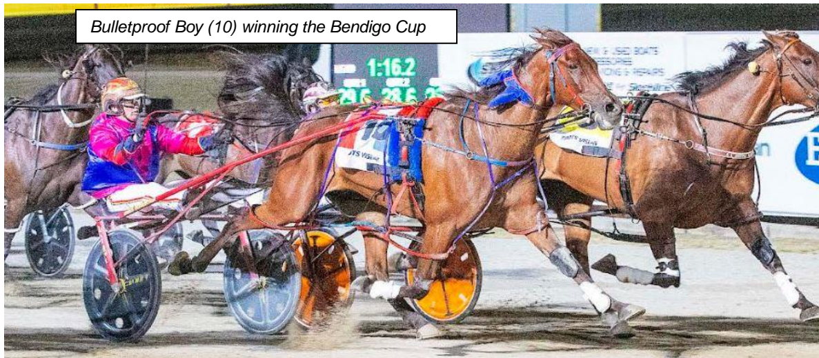
Bulletproof Boy (10) winning the Bendigo Cup

Winning the Bendigo Cup was evergreen 10yo Bulletproof Boy (Art Official USA) who is racing better than ever and has 4 in a row including the $100,000 Ballarat Cup, where he beat amongst others Kanena Provlina (A Rocknroll Dance USA) who won the $50,000 Shepparton Cup after the stewards disqualified first past the post Captain Hammerhead. Another sure thing is Eureka and Inter Dominion winner Don Hugo (Art Major USA) who will certainly answer a few questions in attempting to carry his previous performances into this grand circuit event. What makes this race more exciting is the new – and old – blood mixed together, not the same horses running against each other.