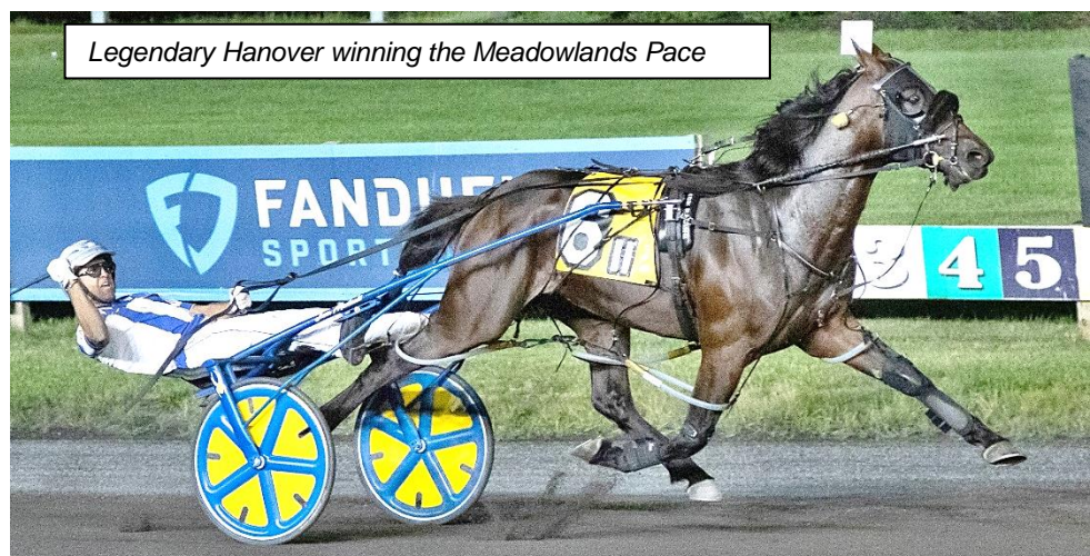
Legendary Hanover winning the Meadowlands Pace

☑ Hanover Shoe Farms was named the Dan Patch 2024 Breeder of the Year. Their highest stakes earners were 2024 Dan Patch 2YO Trotting Colt of the Year and Breeders Crown winner Maryland (Chapter Seven) $1,227,695 and 2024 Dan Patch Older Pacing Male Abuckabett Hanover (Betting Line) $833,022 for the season. They also bred 3yos Mirage Hanover (Bettors Delight) and Legendary Hanover (Huntsville) 1:46.2 $1.1 million. Hanover won Pacing Broodmare of the Year with Lillian Hanover (Well Said) , the dam of Linedrive Hanover 1:47 and his half brother Legendary Hanover , who is standing his first season at stud in 2025.