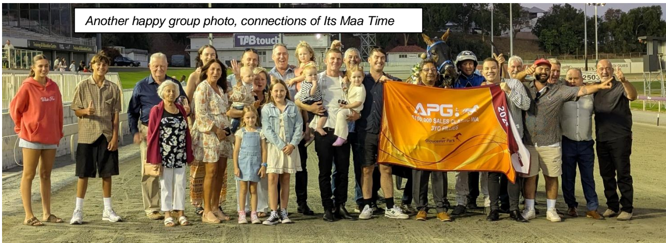
Another happy group photo, connections of Its Maa Time