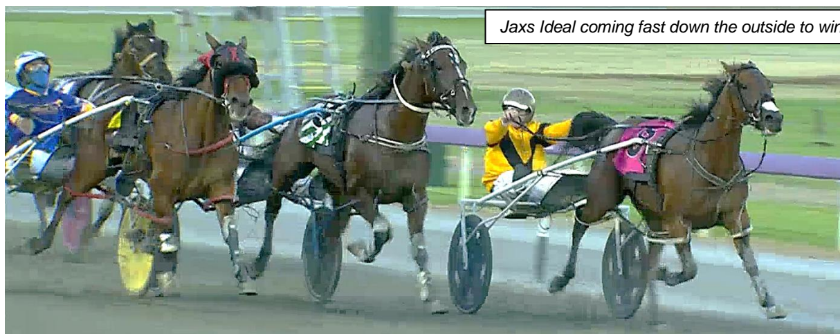
Jaxs Ideal coming fast down the outside to win

started at the attractive odds of 20/1 from 7 in the $21,000 3YO Pace, restrained from the barrier by Gary Hall Jnr to settle last on the pegs while the leaders were diminishing their chances in a 35.1 lead, followed a 3 wide move with just over a lap to go, worked forward strongly down the back as the leaders compounded but still lengths to make up, closing fast on the nw leaders down the straight to grab the win in by a head in 1:56.4;