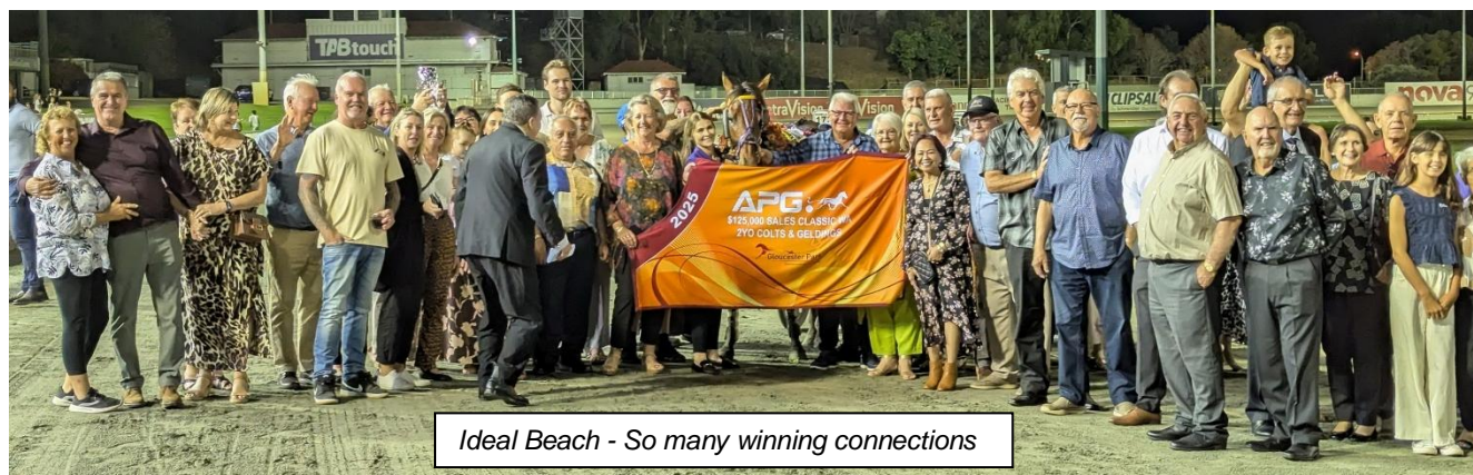
Ideal Beach - So many winning connections