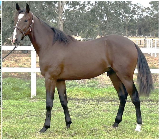
Maddy White colt

Fillies averaged $25,308 (median of $18,000), with their average downgraded by the large number of fillies released by their vendors for a bargain price. It is clear that we as an industry need to do more to make fillies a valuable racing commodity and do better at supporting the mid range horses with racing opportunities.