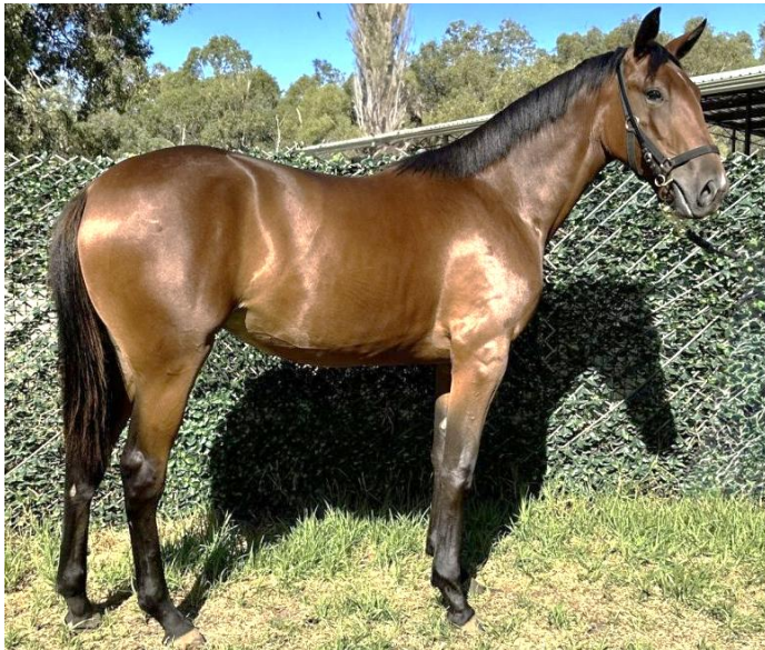
Double Espresso filly

Of interest is that both of the top priced yearlings feature relatively unwanted stallions in their breeding - the dam of Double Espresso is by Westsired stallion Rich And Spoilt , who was first past the post in the 2000 WA Derby but lost on protest. Rich And Spoilt was also second in the Australian Derby and Golden Nugget. The sire of Maddy White is the Australian bred stallion Lombo Mandingo , who was unfortunate to race against Australian 2yo and 3yo Horse of the Year Lombo Pocket Watch when he was winning 27 of his first 30 starts, and who was from the same Misty Maiden family as Maddy White and Lombo Pocket Watch.