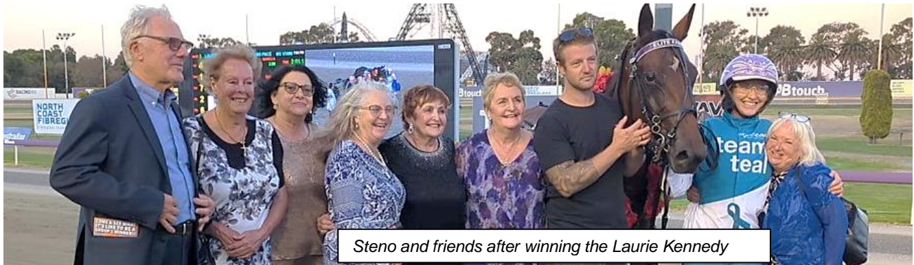
Steno and friends after winning the Laurie Kennedy