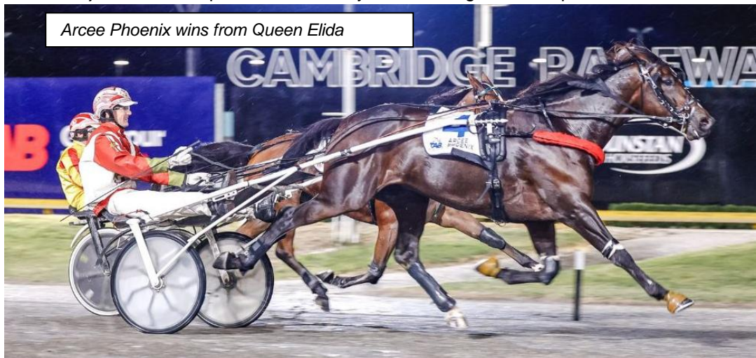
Arcee Phoenix wins from Queen Elida

Meanwhile, The Locomotive is in Sweden for his brush with the elite of trotting in the 2025 Elitloppet at Solvalla in Sweden on 25 May.