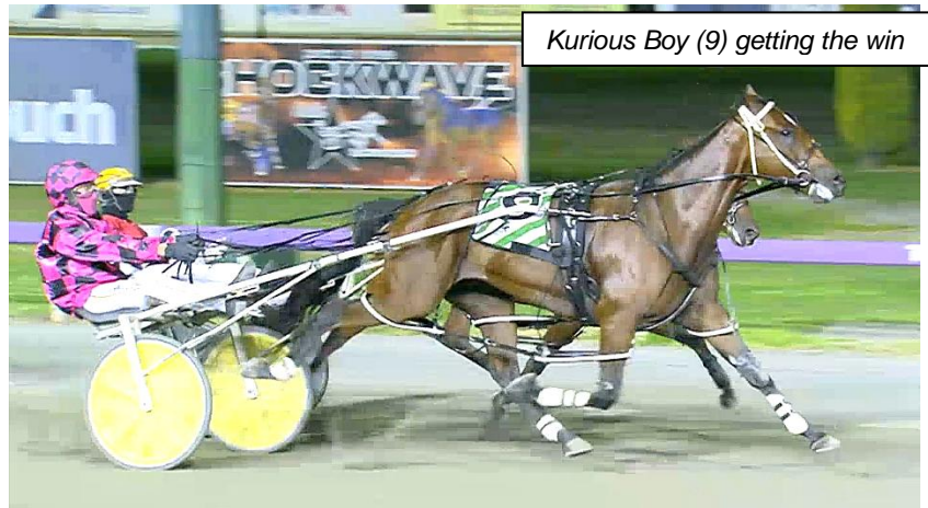
Kurious Boy (9) getting the win

Bonus payments for the month continued the lower trend for the year, with $74,000 in payments to Westsired progeny in March 2025, although this was roughly 55% higher than the previous month.