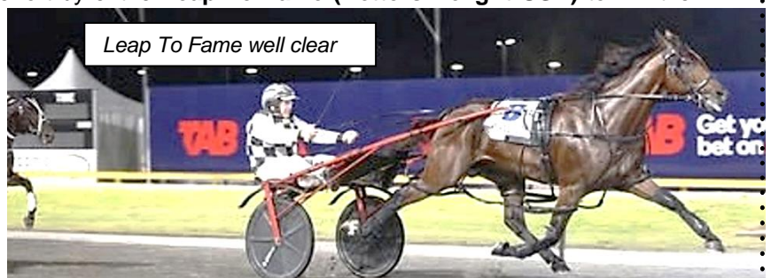
Leap To Fame well clear

☑ You can really only say it was a stunning effort by entire Leap To Fame (Bettors Delight USA) to win the NZ $1 million Race by Betcha – his 50 th win from 63 starts - with no favours from the barrier, no favours in running and no favours from the weather. The win took his stakes to over $4 million. No disgrace to the younger Don Hugo (Art Major USA), with connections choosing to abandon Nullarbor plans after the effort. He is still a young horse and has a big future and has plenty of