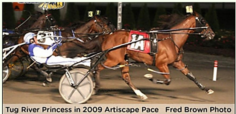
Tug River Princess in 2009 Artscape Pace

Twisted Destiny is out of World Champion 2005 mare Tug River Princess (Badlands Hanover) 1:49.3 $1,830,155 who was the winner of the $376,000 Roses Are Red at Mohawk, $257,000 Golden Girls at the Meadowlands and the $127,000 Artscape Pace along with her other accomplishments. She was the 2008 Dan Patch 3YO Filly Pacer of the Year and her 8 winning progeny have won over $2 million in stakes. Perhaps her quirky named granddam Awestralian (Armbo Aussie) is a clue for the future!