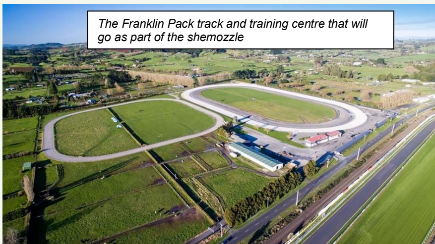
The Franklin Park track and training centre that will go as part of the shemozzle

☹ A sad but inevitable day given the circumstances. Auckland Trotting Club (ATC) members have voted to sell the club's remaining real estate in order to pay off their $120m debt over the failed development of Alexandra Park. Although the club won an $83 million judgement against the developer, that company was placed into voluntary liquidation soon after, leaving ATC with their original debt plus interest. The process will also involve the loss of the Franklin Park training facility, with the $70 million from its sale to be fully recovered by April 2027 if the deal is finalized. The club will also need to offload their commercial units at Alexandra Park to clear the remaining debt. There are still significant hurdles for the industry in finding funding for the provision of a replacement training centre. You can only wonder if the company directors involved in the original development are enjoying their $83 million windfall.