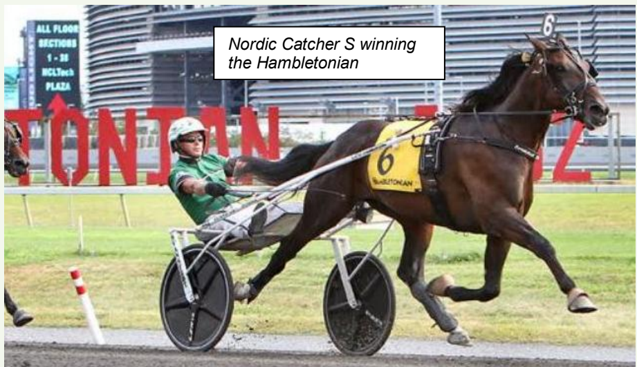
Nordic Catcher S winning the Hambletonian